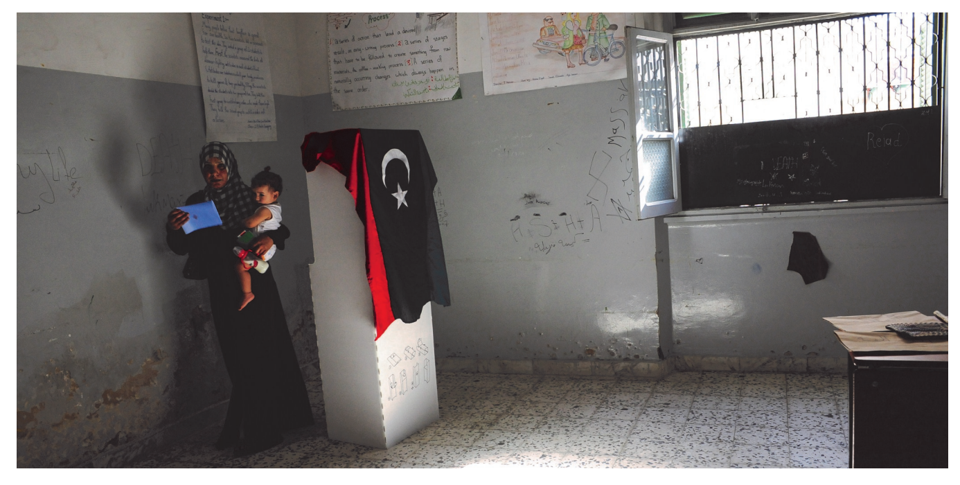
WOMAN VOTING IN TRIPOLI, JULY 2012