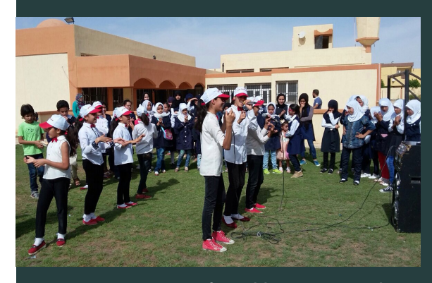
Opening ceremony of a public recreational park created through a social peace initiative

Managing conflicting interests and needs through inclusion, dialogue and collaboration, so that decisions are made fairly and no one feels the need to use violence to protect their rights.