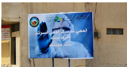
Social Peace Partnerships have been active in COVID-19 Public Awareness Campaigns

Institutionalising inclusive and participatory approaches to decision-making at the municipality level, which enable different community stakeholder groups (including marginalised ones) to participate in consultations and decision-making processes.